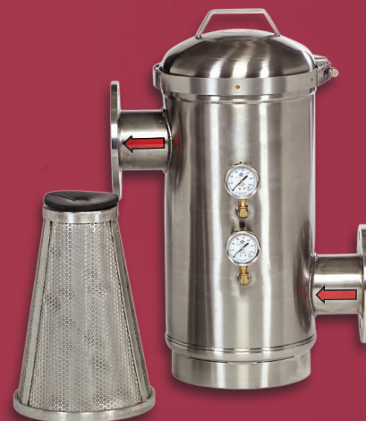
MLS-6 WITH BOLT ON LID AND OPTIONAL PRESSURE DIFFERENTIAL ALARM (PDA) AND AUTOMATIC TIMER FLUSH (ATF)

The picture below shows the conical filter screen removed from the housing